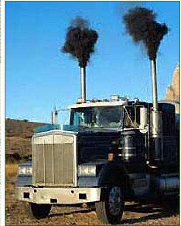
Reduce Diesel Emissions